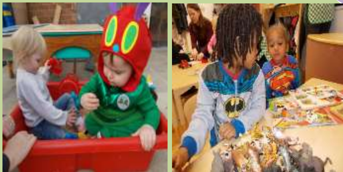
A play session at PESTS with some of the children on World Book Day

Hello Everyone, Welcome to our Summer 2017 Newsletter. I hope you are all enjoying the warmer weather.